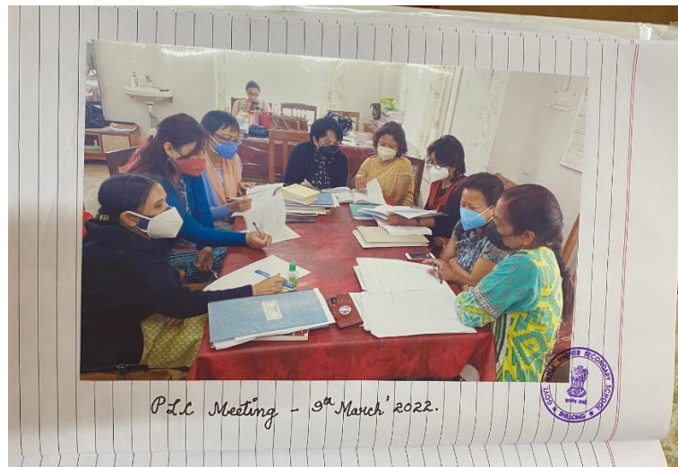
PLC Meeting - 9 th March 2022.