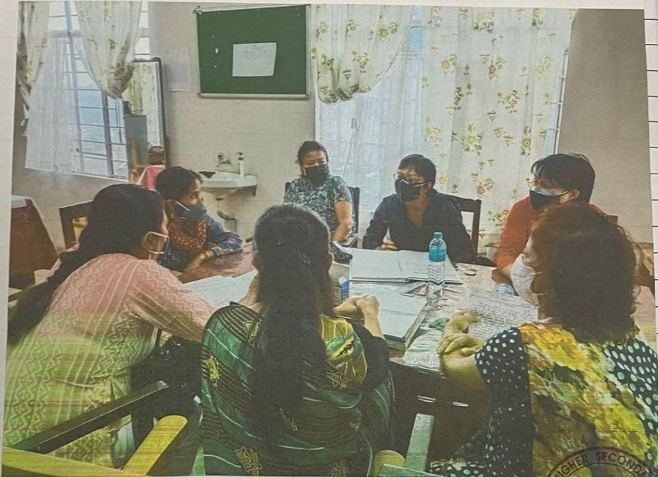
PLC MEETING - 7 th October '21